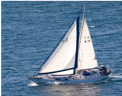
Chimere doing 8-9kts on arrival at Pittwater, NSW, 2009