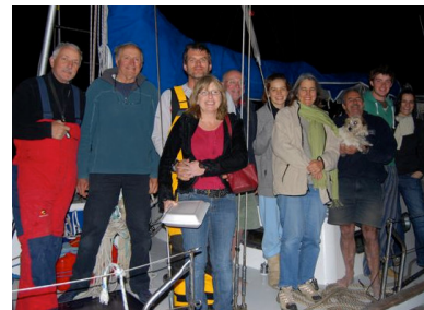
Chimere arrives safely in Sydney after her voyage from Vanuatu, 2010

Again, it's one of the benefits of shared ownership that you only pay 50% of the costs, but enjoy 100% of the boat's use when she's under your command.