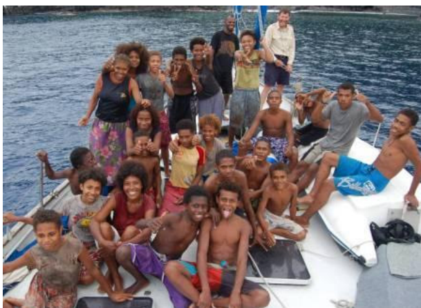
A popular anchorage, Mere lava, Vanuatu

We have prepared a draft " Boat Share Agreement " for prospective partners to consider. It is designed to go some way towards matching expectations and dreams with what might, or might not be possible through owning a share of Chimere. After reading the document your comments, suggestions and feedback would be warmly welcomed.