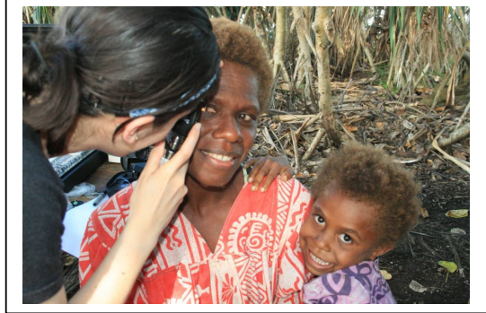
Eye clinic on Tanna, 2009

Then over the next three months we met and transported two further medical teams on their two-week tours of duty. By the end of July we'd made it to 18 islands in all, assisting the medical teams conduct 48 clinics and see 4,220 patients. Over 2,500 pairs of glasses were dispensed with nearly 300 surgical procedures being arranged. A great result!