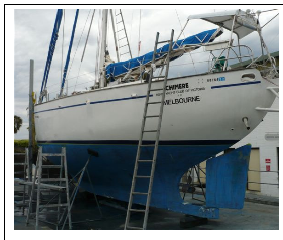
Chimere on the dry having her bottom checked

A very big thank you to those who have provided MSM with much needed financial support and encouragement over the past 9 months. It's amazing how every little bit counts and adds up.