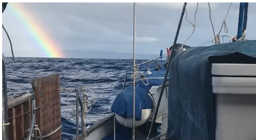
Sailing amongst the islands of Vanuatu – can't have a rainbow without the rain