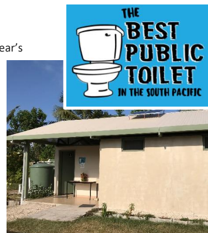
The Supporters Tour included a "Village Experience Tour" to the village of Paunangisu, "The 3 Hour Tour", Day Sails on Chimere and complementary use of the BEST Public Toilet in The South Pacific