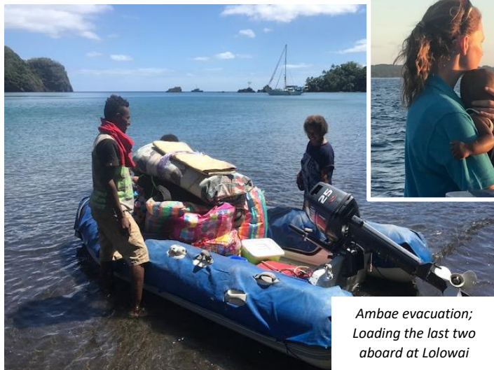
Ambae evacuation; Loading the last two aboard at Lolowai