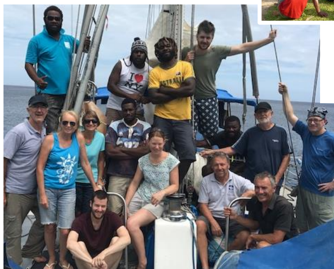
Left: The "After" shot from Mission 4 in 2017. Aboard Chimere - Banks Group, Vanuatu. A mix of 15 people – sailors, doctors, dentists, nurses, plus eye-care and dental care workers, both volunteer and local, including Vanuatu (Govt) Ministry of Health and PCV Health staff (ie Presbyterian Church of Vanuatu Health department)