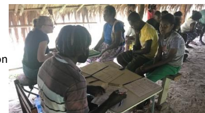
Conducting the National Oral Health Survey in a village setting