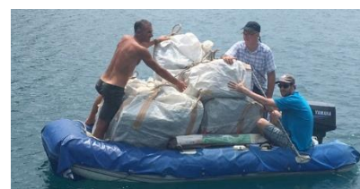
Each clinic requires the transportation of a lot of gear