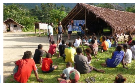
Above: A village oral health presentation conducted by local health professionals (Ureparapara Is, Banks Group)